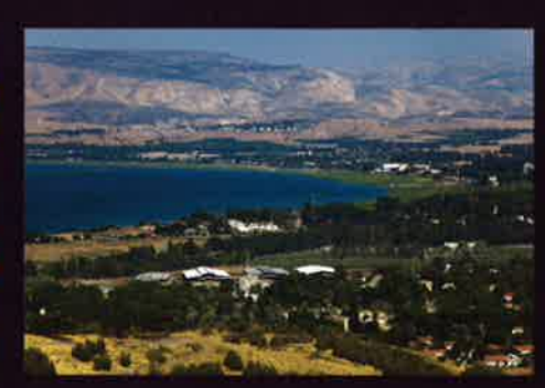
Sea of Galilee