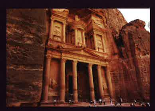
The Treasury at Petra

This morning we will visit the Jordan River and have the opportunity for a baptismal service. Drive along the Jordan