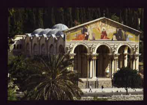
Church of all Nations