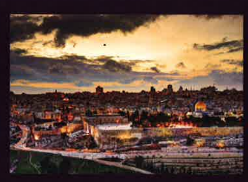
Sunset over Jerusalem